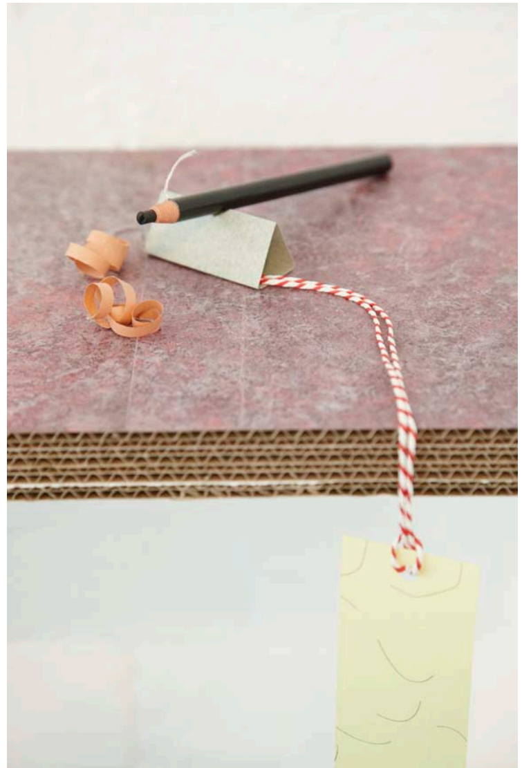
El Busta's Travelling Photography Studio, 2012.