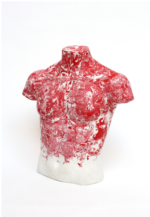
Laura White, We Can Have It All , 2012. SpaceX, Exeter.