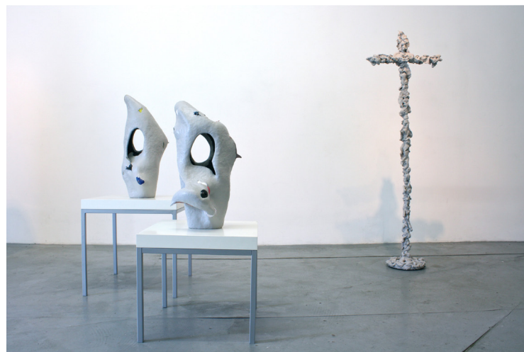
Laura White, The Shapes Game: its hard to take your eyes off it... 2012. Mixed media. Installation view. Carter Presents, London.