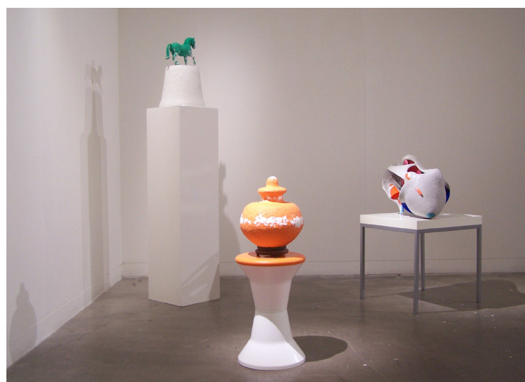
Laura White, Jesus loves you . 2012. Mixed media. Blyth Gallery, London. (3 Part work)