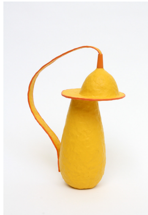
Laura White, We Can Have It All , 2012. SpaceX, Exeter.