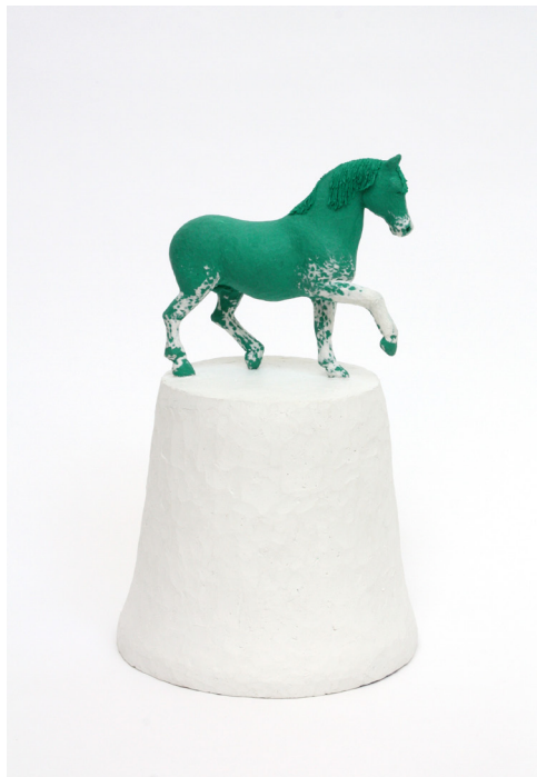
Laura White, We Can Have It All , 2012. SpaceX, Exeter.